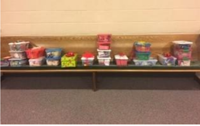
Mu members brought in 22 shoeboxes that were distributed to homeless students in NRMS.