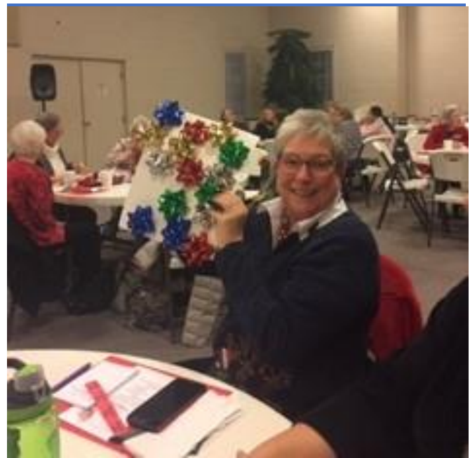
Mu Members enjoy an activity with bows after a delicious meal at the December meeting.